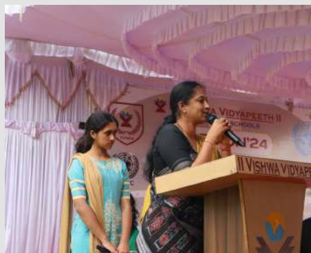
Speech by The Director