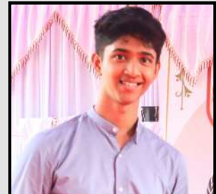
ARAV N B CCC - CO CHAIR