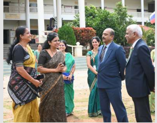
A Cherishing Moment