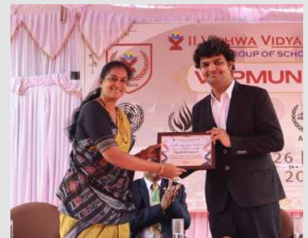
Honouring Secretary General