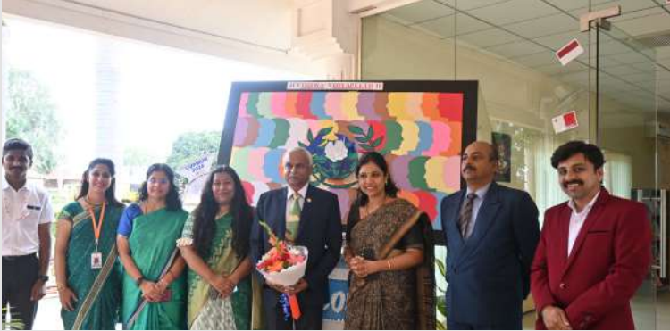
Welcoming the Guest