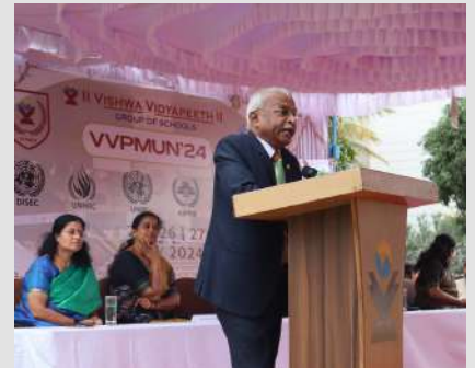
Speech by The Chief Guest